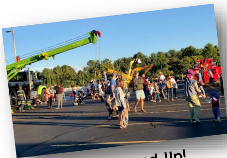
Big Rig Round-Up!