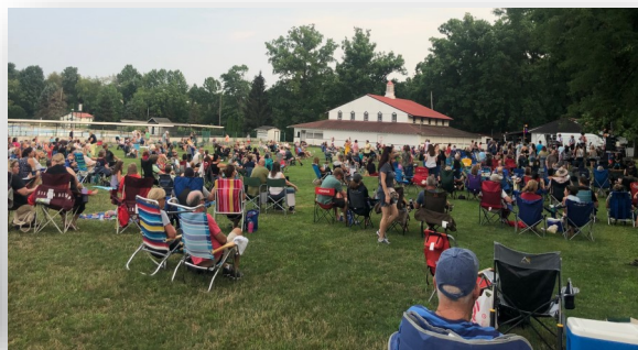
Summer Concerts and Movies!